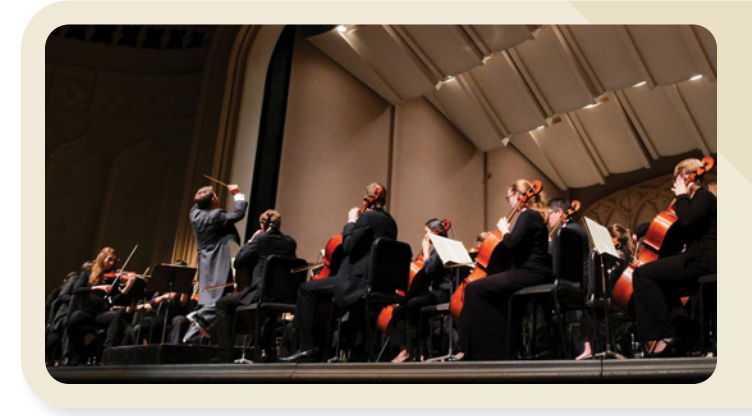
Click or tap to visit the College of Music website at colorado.edu/music