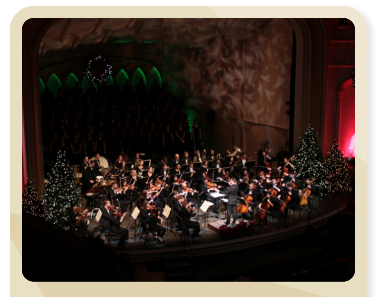
Holiday Festival Tickets start at $23