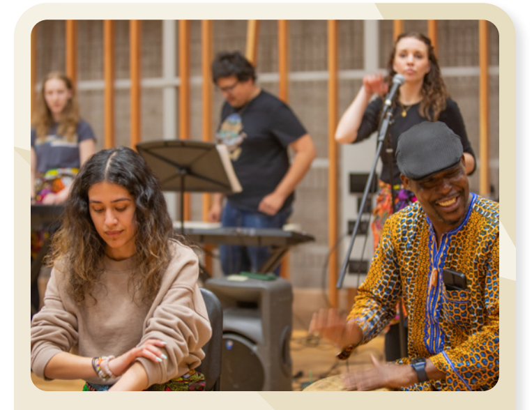
Educational Events Free, reservation requirements vary