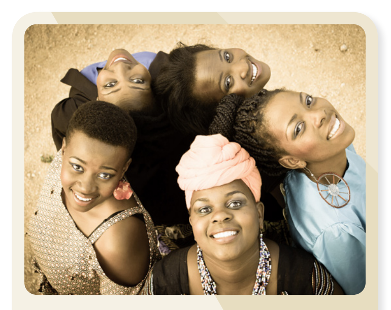
Artist Series Tickets start at $20

Event details are subject to change, but the CU Presents website will always be up to date. Click or tap below to explore your options.