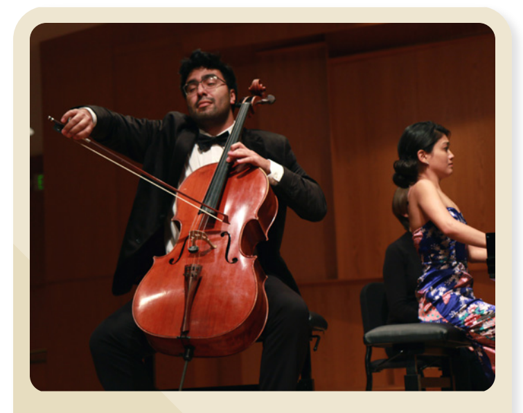
Student Recitals Free, no tickets required