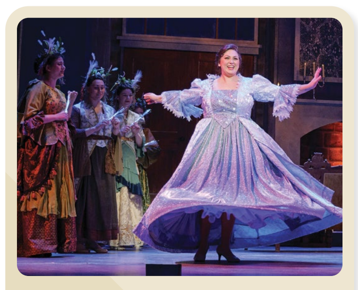
Eklund Opera Tickets start at $15