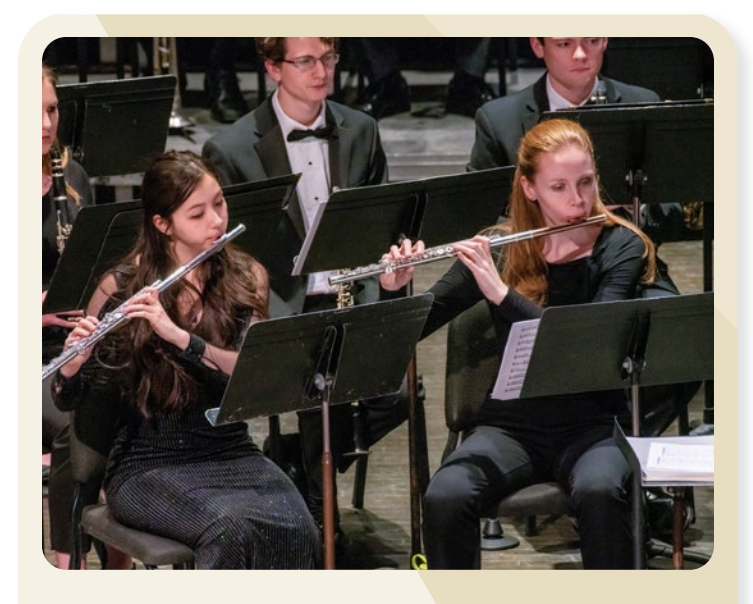
Student Ensembles Free, no tickets required